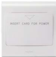
Key Fob Switch